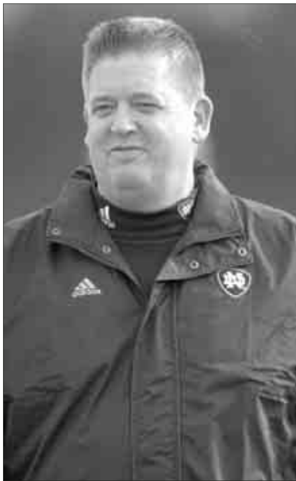
Notre Dame head football coach Charlie Weis is the owner of four Super Bowl rings from his impressive career as an NFL assistant coach.

From 1997 to '99 (with Parcells as head coach and