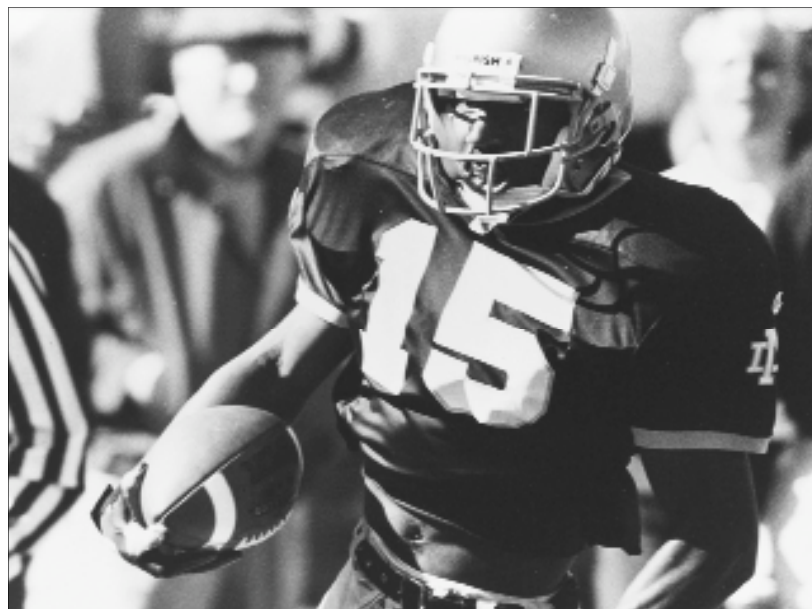
Allen Rossum led the nation in punt returns in 1996 at 22.93 yards per attempt and was sixth in kickoff returns in 1997 at 28.50 yards per attempt.