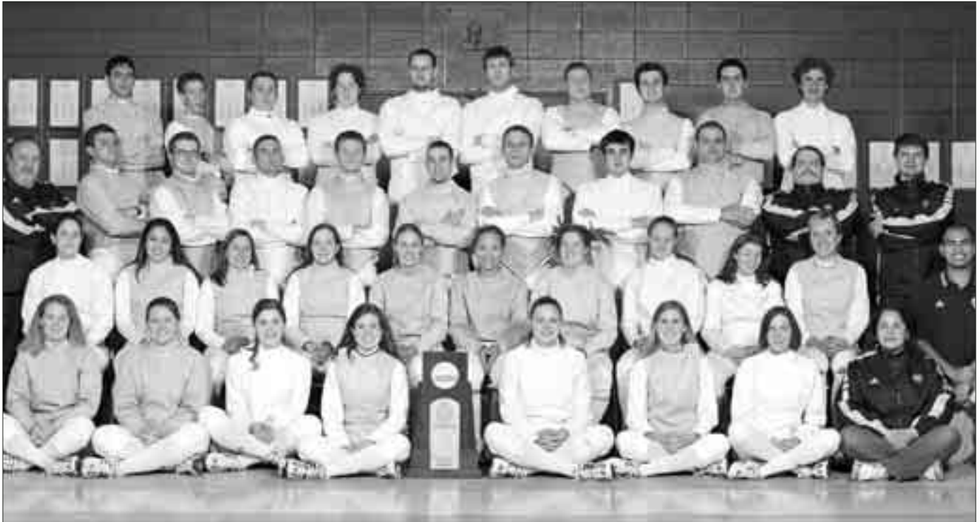
With the help of Notre Dame's national championship in fencing, the Irish placed 13th in the 2002-03 NACDA Directors' Cup Final Standings.

The National Association of Collegiate Directors of Athletics, USA Today and the United States Sports Academy began sponsorship of the NACDA Directors' Cup competition in 1993-94.