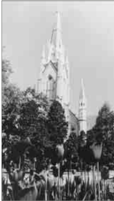
Basilica of the Sacred Heart

the first in the United States, and the University also founded the first publication series dedicated specifically to medieval topics.