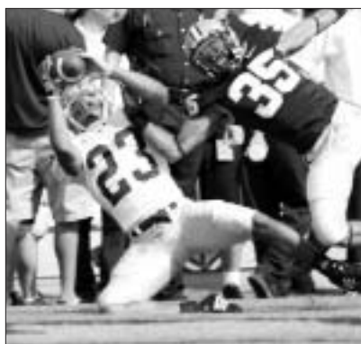
Wide receiver Golden Tate tallied a game-high 104 receiving yards and one touchdown on three receptions at Purdue. Tate gained 43, 36 and 25 yards on his three catches.