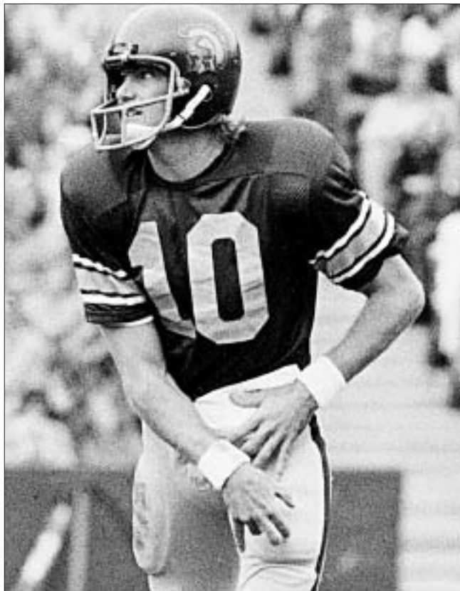
Former USC quarterback Pat Haden was one of seven players who then held the opponent touchdown pass record (now it's five shared by Tyler Palko and Matt Leinart) after he threw four against the Irish in 1974. Haden currently serves as the television analyst for all Notre Dame home games on NBC.