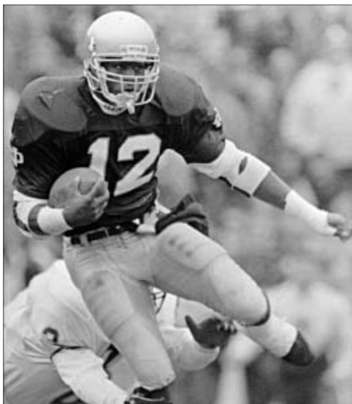
Ricky Watters, whose 81-yard punt return for a touchdown against Michigan in 1988 helped kickstart Notre Dame's national championship season, set the record a year later for longest punt return in Irish history with a 97-yarder versus SMU.