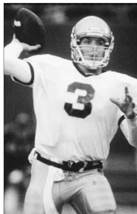
Quarterback Rick Mirer led the 1991 Irish to a then school-record 426 points, averaging 35.5 points per contest over the span of the 12-game regular season.