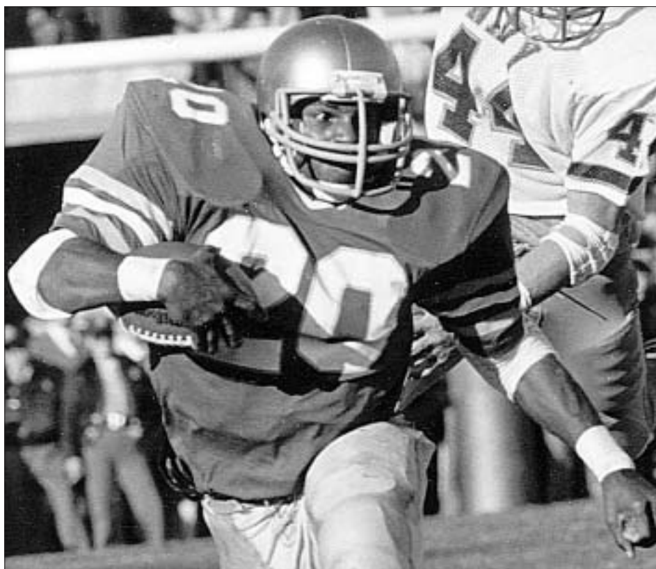
Allen Pinkett ranks first on the all-time scoring list with 53 touchdowns and 320 points. Pinkett also holds the second- and third-highest single-season scoring figures with 110 and 108 points, respectively, in 1983 and 1984.