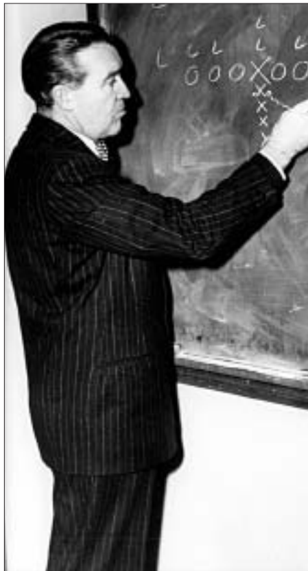
Frank Leahy's 1946 Irish squad set the modern Notre Dame record for fewest points allowed in a season, yielding only 24 points in nine games.

Fewest First Downs 0 . . . . . by Wabash, 1924; Kalamazoo, 1923; St. Louis, 1922; Michigan State, 1921 Modern Record: 1 by USC, 1950 & Carnegie Tech, 1941