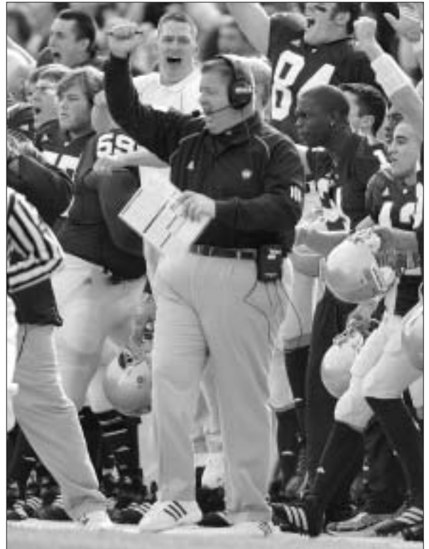
Charlie Weis has won more games through his first two seasons at Notre Dame than any previous Irish head coach in his first two years. The 19 victories under Weis are the most by a Notre Dame team in consecutive seasons since 1992-93.

One of the top questions in college football this year is who will replace Brady Quinn as quarterback at Notre Dame. After starting 46 consecutive games and setting 36 school records, the most prolific passer in Irish history graduated, leaving a