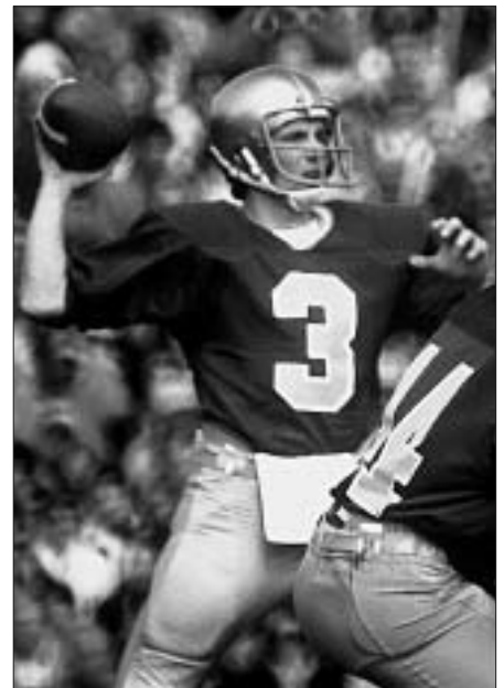
Joe Montana passed for 4,121 yards in his career at Notre Dame. He was a key factor in Notre Dame's 1977 national championship season and will be long remembered for rising from a reserve quarterback with the Irish to a multiple Super Bowl champion with the NFL's San Francisco 49ers.