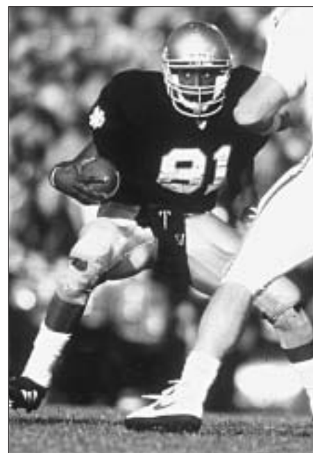
Tim Brown was Notre Dame's most recent Heisman Trophy winner, earning the award in 1987.

Bertelli passed away on June 26, 1999, while Hart died on Sept. 24, 2002.