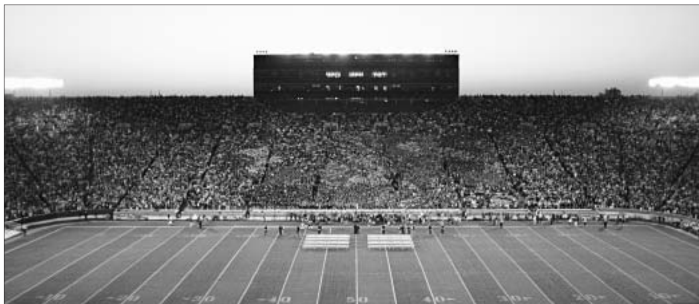
Over 50,000 fans packed into Notre Dame Stadium on Oct. 14, 2005, for the pre-game pep rally before the legendary matchup between the Irish and #1 USC.