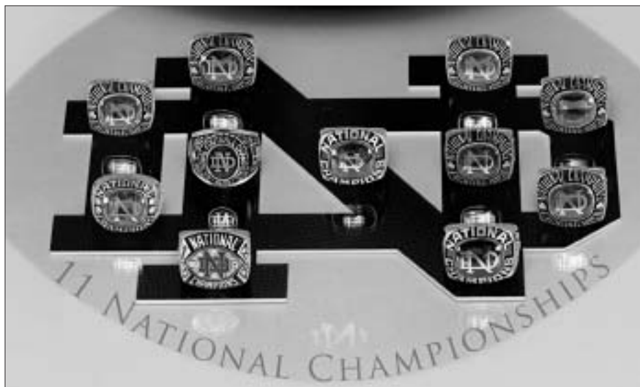
The championship rings from Notre Dame's 11 consensus national championship seasons during the 2005 season.

PEP RALLIES – An essential part of a football weekend at Notre Dame is the traditional Friday evening pep rally. The band historically mustered the students with its march through the campus and arrived as the head of a parade of Irish faithful at the University's Stepan Center. Interest in recent years has prompted a move to the Joyce Center arena for the 6 p.m. (with the team entering the arena at 6:30 p.m.) gatherings, while in '97 the first two pep rallies were held outside in Notre Dame Stadium, as was the first one in '98 and 2000. On Sept. 5, 1997, the pep rally before the Georgia Tech game – in conjunction with the rededication of Notre Dame Stadium – was held in the facility and attracted approximately 35,000 fans. Some of the featured pep rally speakers in recent years have included television personality Regis Philbin, basketball analyst Dick Vitale,