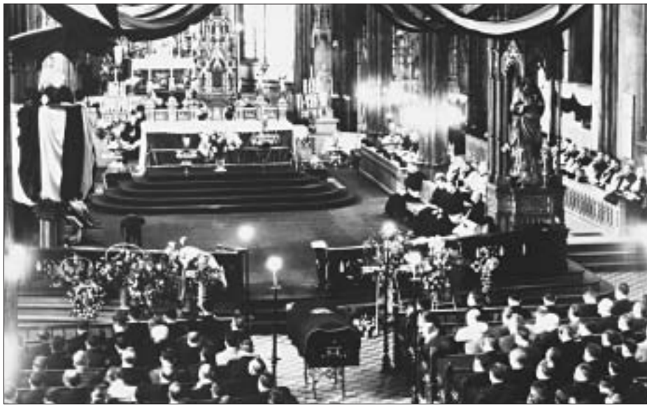
Knute Rockne's funeral in 1931 was the first in the United States to be broadcast live nationally on radio.