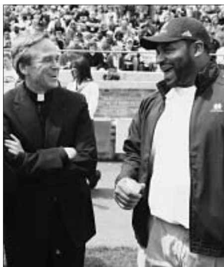
Notre Dame president John I. Jenkins, C.S.C., shares a laugh with former Irish fullback Jerome Bettis, who led the Pittsburgh Steelers to their fifth Super Bowl title in 2006, and was one of Notre Dame's most recent alumni to earn All-Pro honors in the NFL at the end of the 2004 season. Bettis returned to campus to serve as an honorary coach for the 2006 Blue-Gold spring game.

ALL-PRO – Notre Dame has produced more than its share of talented players who have gone on to stellar careers in the National Football League. In fact, 58 former Irish greats have been selected to the NFL Pro Bowl, with the most recent including now retired Pittsburgh running back Jerome Bettis (years at Notre Dame -- 1990-92), Arizona defensive end Bertrand Berry (1993-96) and Atlanta kick returner Allen Rossum (1994-97) in 2005. Hall of Fame defensive end Alan Page (Minnesota Vikings) and 1987 Heisman-Trophy winning wide receiver Tim Brown (Oakland Raiders) share the record for most All-Pro selections by a former Irish player, with both selected to the Pro Bowl nine times in their storied careers.