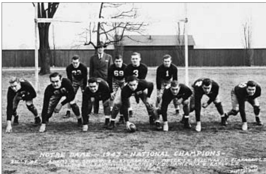
The 1943 team faced possibly the most difficult schedule in school history and finished 9-1, earning the program's first Associated Press national championship.

former Los Angeles Dodgers manager and Baseball Hall of Famer Tommy Lasorda and Chicago Cubs manager Dusty Baker – while hockey legend Wayne Gretzky topped the special-guest list for the pep rally prior to the 1999 game versus USC.