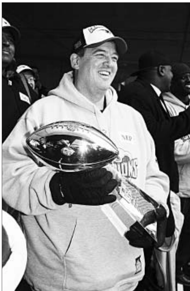
Charlie Weis was a member of four NFL championship teams before taking over the Notre Dame football program. He won Super Bowl titles with the N.Y. Giants (1990) and New England Patriots (2001, '03, '04).

(St. Louis Rams), Lynch (Kansas City Chiefs), Kuechenberg (Miami Dolphins) and Watters (San Francisco 49ers).