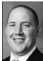
Buzz Williams Head Coach