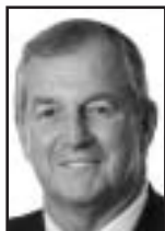
Jim Calhoun Head Coach