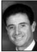
Rick Pitino Head Coach