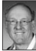
Jim Boeheim Head Coach