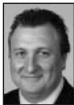
Bob Huggins Head Coach