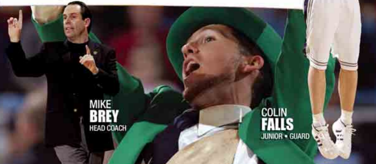
MIKE BREY HEAD COACH

† — John R. Wooden Tradition (Indianapolis, Ind.) * — indicates BIG EAST game