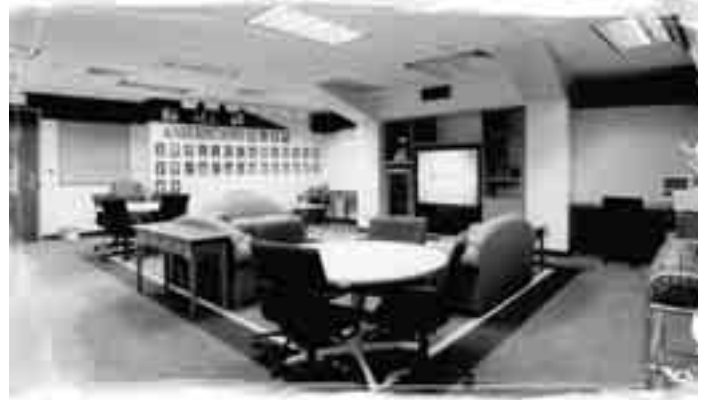
The Notre Dame basketball team locker room in the Joyce Center was renovated and expanded prior to the start of the 1999-2000 season making it one of the top facilities in the nation. The area includes a locker room, team room, trainer's area, manager's office and expanded storage area.