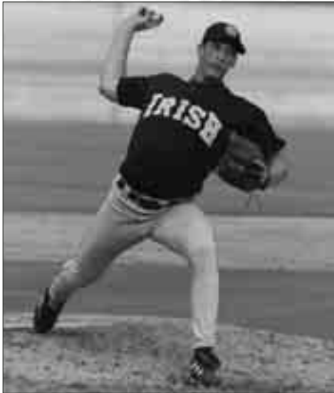
Two-sport sophomore standout Jeff Samardzija could develop into a top starter on the 2005 staff.

per 9 innings. The 6-5, 225-pounder has made huge strides during his time at Notre Dame while gaining greater consistency with his slider and changeup, to go along with a tough low-90s fastball.