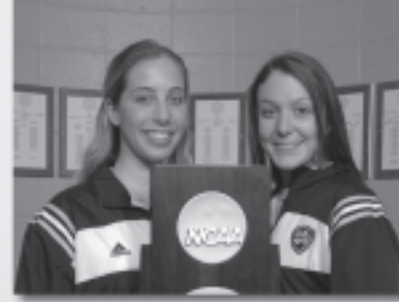
Mariel Zagunis (Fr.; Beaverton, OR) 2nd-Place (21-2)