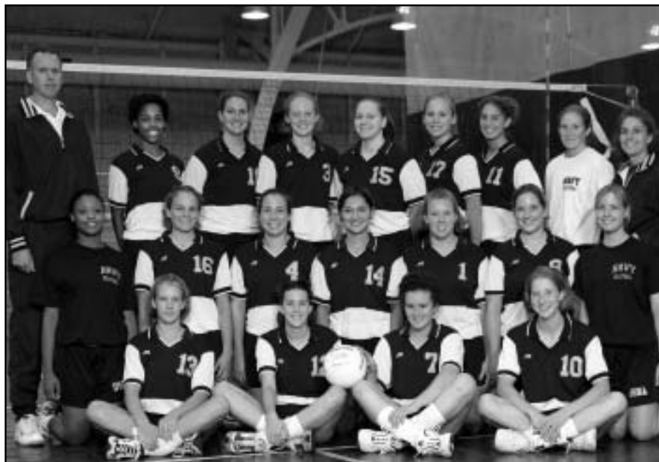
Navy's 1999 team was the top-seeded team at the league tournament and advanced to the league championship match.

^ - Trident Classic (Annapolis, Md.) % - Falcon Invitational (Colorado Springs, Colo.) * - Patriot League