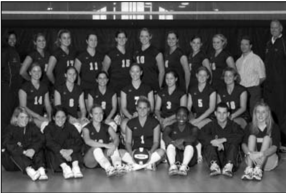
Navy's 2005 team tied for second place in the final Patriot League standings, the highest finish for the program in six years.