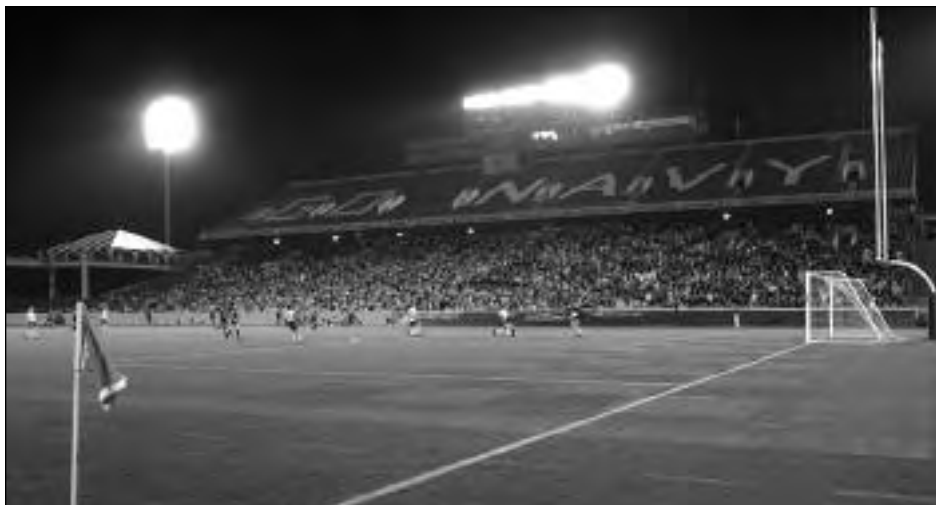
Navy held 18-time NCAA Tournament Champion North Carolina scoreless for more than 72 minutes in front of an NCAA-record crowd 6,527 fans at Navy-Marine Corps Memorial Stadium in 2003.