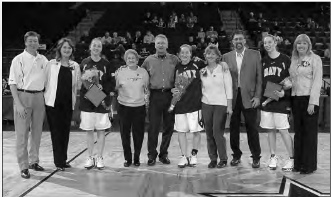
Navy's Class of 2006 and their families during Senior Day ceremonies held prior to the Colgate game.