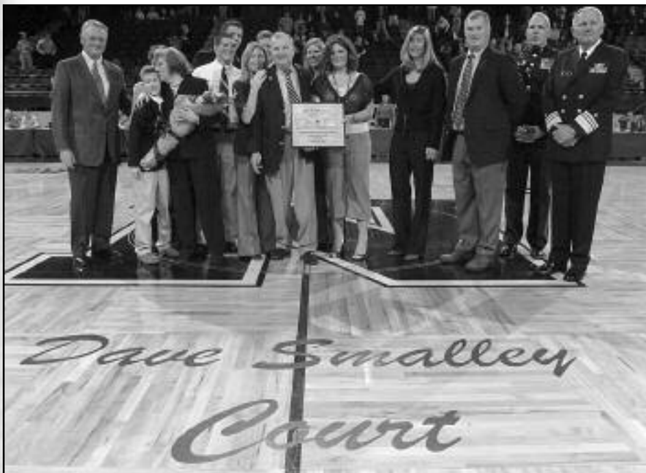
The Alumni Hall court was dedicated as Dave Smalley Court in 2006.

Smalley passed away in the spring of 2007.