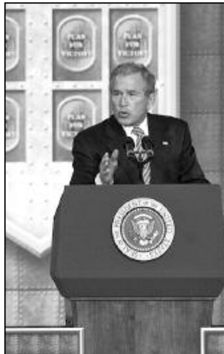
President George W. Bush