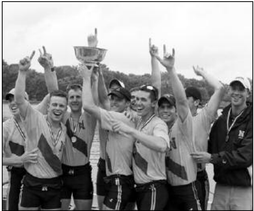
Navy won lightweight titles at the 2004 Eastern Sprints and IRA regattas.