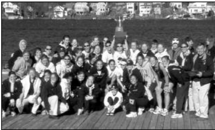
Navy's women's team won the inaugural Patriot League Championship in 2005.