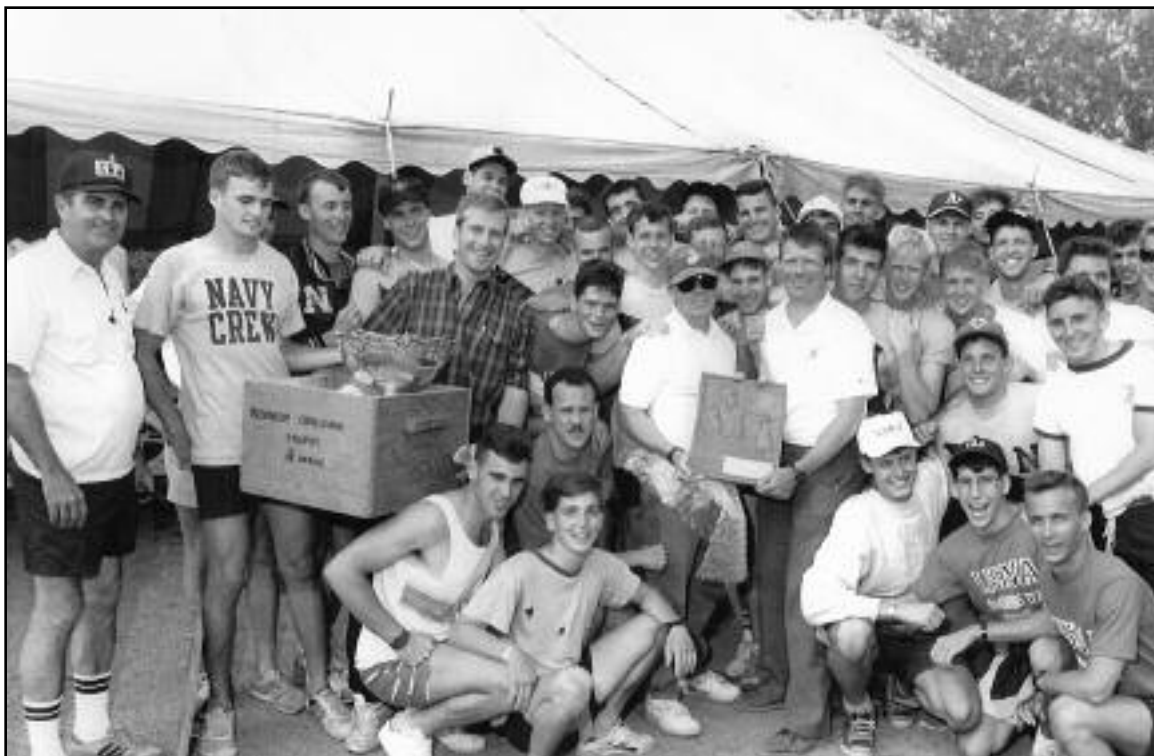
Navy's heavyweight program won the 1990 Ten Eyck title for accruing the most points as a team at the IRA Regatta.