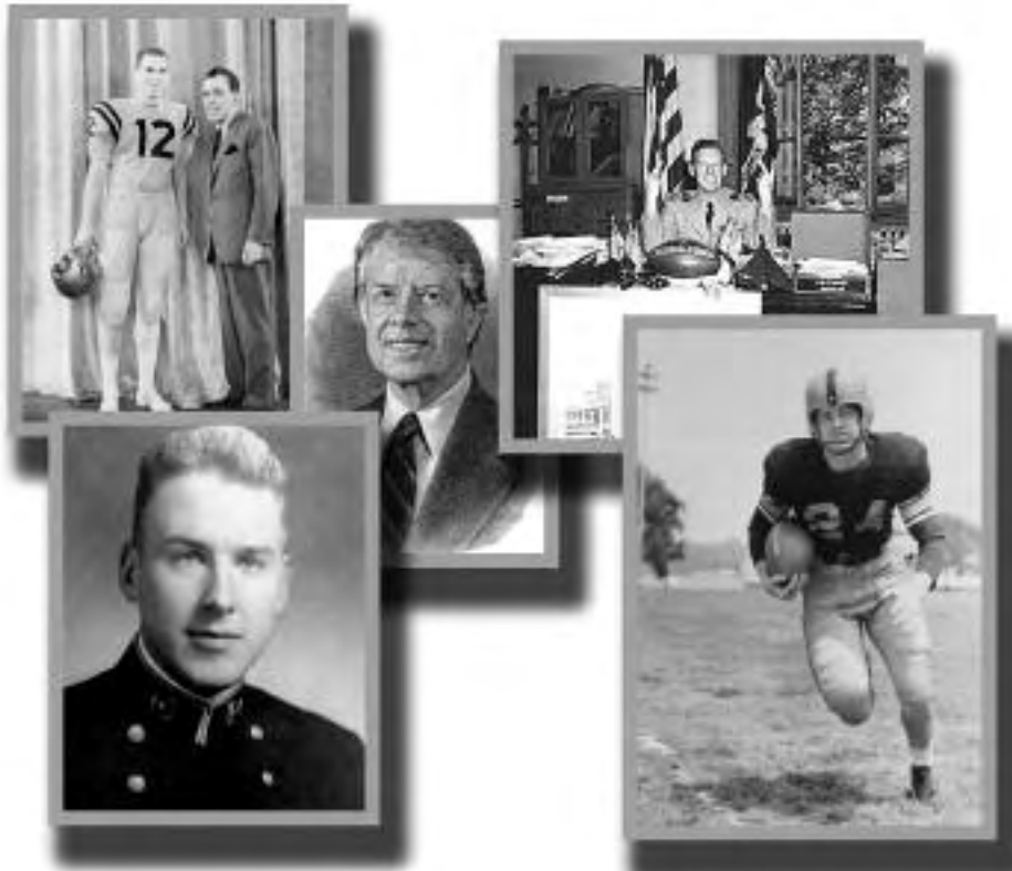
Clockwise, lower Left to Right: Captain James A. Lovell; Mr. Roger T. Staubach (on the Ed Sullivan Show); The Honorable James E. Carter; Admiral Eugene B. Fluckey; VADM William P. Lawrence.

Admiral James D. Watkins , USN (Ret.), Class of 1949, former Chief of Naval Operations; former Secretary of Energy in the senior Bush administration.