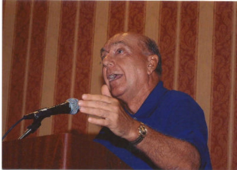
Dick Vitale - Keynote Address

And to top off the luncheon, keynote speaker, Dick Vitale, spoke to more than three hundred people who came to hear him speak after the awards presentations. He gave a most inspirational speech.