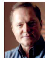
Featured Luncheon Speaker: Scott Boras

MARRIOTT HOTEL MONDAY-TUESDAY; JUNE 21-22 ANAHEIM, CALIFORNIA