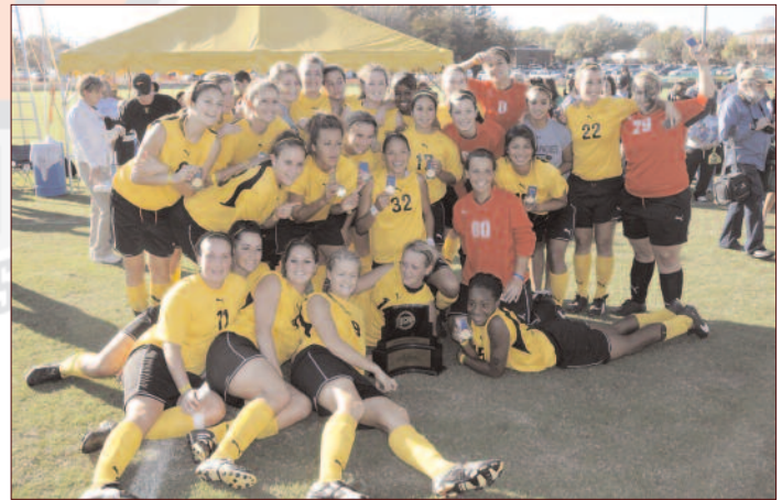
Tyler Junior College (Texas) won the 2009 Division I Soccer Championship by a 3-0 margin.

On the women's side, the Tyler Junior College (Texas) (TJC) women's soccer team won the 2009 Division I Soccer Championship by a 3-0 margin. After just launching their program in 2008, these student-athletes and coaches molded a team in one year that took home the first women's soccer title in TJC history. As tournament hosts, it was icing on the cake to win it in front of a friendly crowd on their home field. The Lady Apaches finished their second season with a 10-0-1 record. Adding to the celebrations on campus, the TJC men's program captured the Division I Soccer Championship in New Jersey.