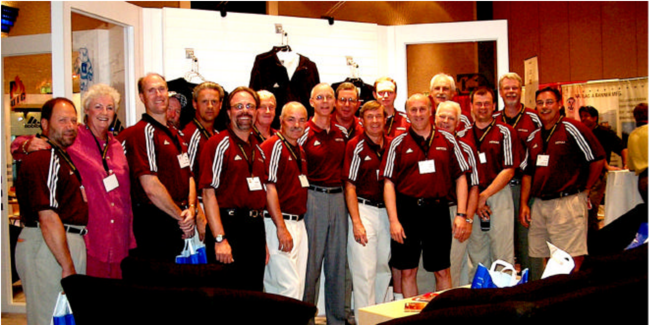
2003 Convention Group