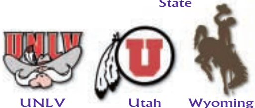
UNLV Utah Wyoming