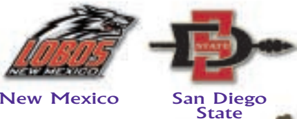
New Mexico San Diego State