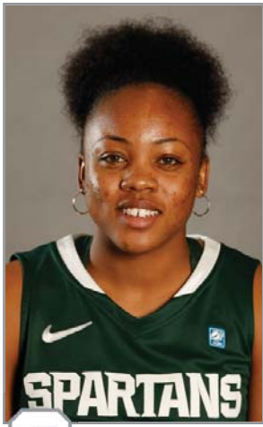
3 PORSCHE POOLE Senior 5-8 • Guard Canton, Ohio McKinley