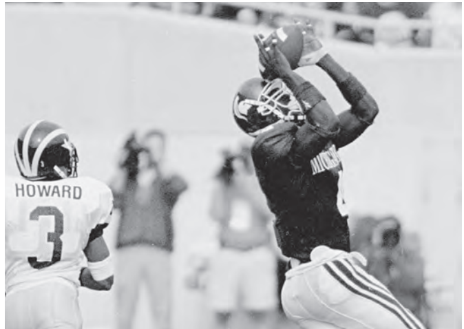
Plaxico Burress, who became the first player in school history to post back-to-back 1,000-yard receiving seasons, had a Spartan Stadium-record 255 receiving yards vs. Michigan in 1999.