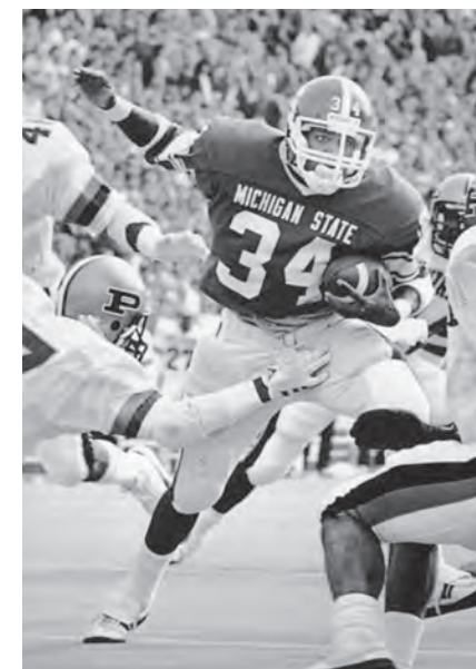
Lorenzo White became the first Spartan running back to lead the NCAA in rushing, averaging 173.5 yards per game in 1985.