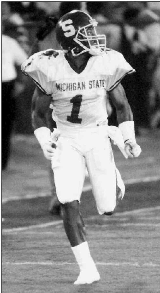
Andre Rison put on an offensive show against Georgia in the 1989 Gator Bowl, catching nine passes for 252 yards and three touchdowns.