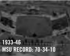
1933-46 MSU RECORD: 70-34-10