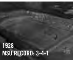
1928 MSU RECORD: 3-4-1

Michigan football All-American Harry Kipke directed the Spartans for only one season. A Lansing (Mich.) High School graduate, he began his coaching career with a 103-0 victory over Kalamazoo College, but highlights after that were few and far between. Kipke nearly directed State to an upset victory over his alma mater, and that performance probably enticed Michigan to hire him as its coach the very next season. He died in 1972 at the age of 73.