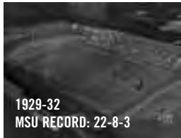
1929-32 MSU RECORD: 22-8-3

Jim Crowley, one of Notre Dame's immortal Four Horsemen, joined Michigan State's staff as its head football coach in 1929. His arrival became the catalyst which transformed a mediocre program into a nationally-respected major power for the first time since the coaching era of John Macklin. "Sleepy Jim" produced four-straight winning seasons for the Spartans. A pair of 0-0 ties against Michigan in 1930 and '31 broke State's 14-game losing streak to the Wolverines, a span which saw UM outscore MSC by a total of 392-9. A night game loss at Georgetown spoiled the Spartans' otherwise undefeated season in 1930. He was named head coach at Fordham in 1933, becoming the architect of the "Seven Blocks of Granite." Crowley died in 1986 at the age of 83.