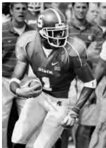
In 2002, Charles Rogers became only the second receiver in MSU history to record back-to-back 1,000-yard seasons, joining Plaxico Burress who accomplished the feat in 1998-99.