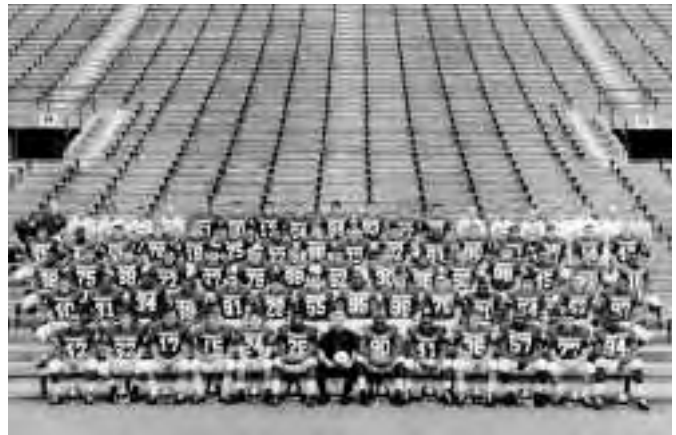
1966 National Champions (9-0-1) Selectors: Consensus – NFF, Football Research, Helms, Poling