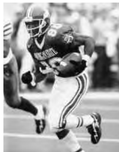
Derrick Mason established Michigan State and Big Ten career records with 2,575 kickoff return yards.