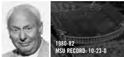
1980-82 MSU RECORD: 10-23-0