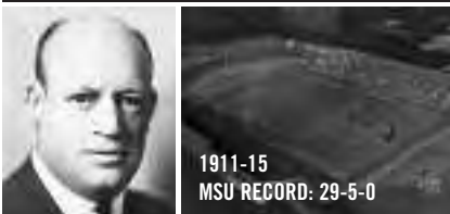
1911-15 MSU RECORD: 29-5-0