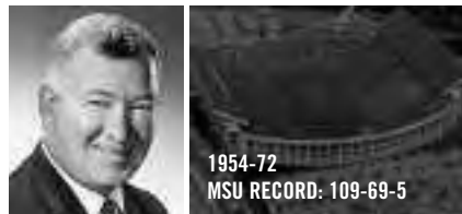
1954-72 MSU RECORD: 109-69-5

One of the most popular coaches in the history of college football was Michigan State's personable Duffy Daugherty. An undergraduate star for Syracuse, he was a member of Biggie Munn's staff there in 1946 when State hired Munn. Daugherty served initially as line coach at MSU, tutoring such Spartan standouts as Don Coleman and Frank Kush. Then, following State's 1954 Rose Bowl victory over UCLA, Munn stepped in as athletic director and named Duffy as head coach. Daugherty's '55 club went 9-1 and received the Big Ten's Rose Bowl bid, defeating UCLA, 17-14. His greatest teams, though, came in 1965 and '66 when those two star-studded squads posted a cumulative record of 19-1-1 and two Big Ten championships. The only loss was a 14-12 defeat at the hands of UCLA in the 1966 Rose Bowl and the lone tie was the monumental 10-10 "Game of the Century" vs. Notre Dame in '66. Duffy's 1965 Spartans were a defensive juggernaut and won the No. 1 ranking in the final UPI poll. During Duffy's 19 seasons at MSU, 29 different players earned first-team All-America honors. The list included such stars as Earl Morrall, Sherman Lewis, George Webster, Clinton Jones, Gene Washington, Bubba Smith, Brad Van Pelt and Billy Joe DuPree. Daugherty's individual honors included National Coach of the Year laurels in both 1955 and '65, and induction into the College Football Hall of Fame in 1984. Duffy died in 1987 at the age of 72, in Santa Barbara, Calif.