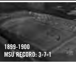
1899-1900 MSU RECORD: 3-7-1