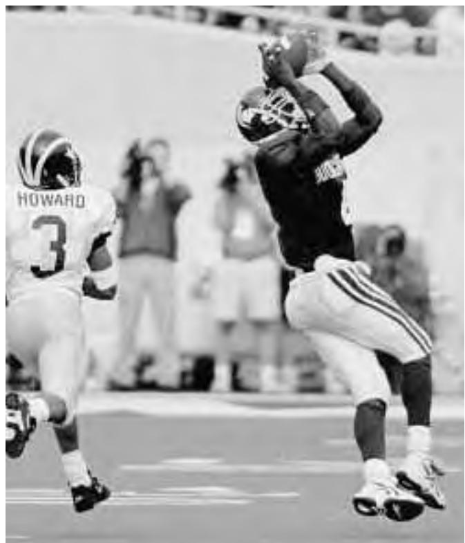
Plaxico Burress, who became the first player in school history to post back-to-back 1,000-yard receiving seasons, had a Spartan Stadium-record 255 receiving yards vs. Michigan in 1999.