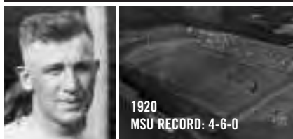
1920 MSU RECORD: 4-6-0

George "Potsy" Clark, an All-America quarterback under the legendary Bob Zupke at Illinois, served as MAC's coach for only one season. The Aggies had a losing record, but one of those victories was a record 109-0 rout of Olivet. Among his other stops in college coaching were at Minnesota and Butler. He also served as athletic director at Nebraska, 1945-1953. Clark is probably best known as head coach of the Detroit Lions that won the 1935 NFL title. He died in 1972 at the age of 78.