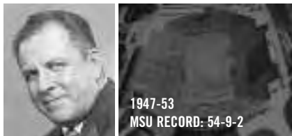
1947-53 MSU RECORD: 54-9-2