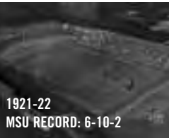
1921-22 MSU RECORD: 6-10-2