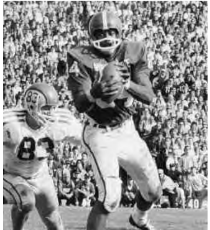
Gene Washington, who had six career 100-yard receiving games, averaged a Spartan single-season record 25.0 yards per catch in 1966.