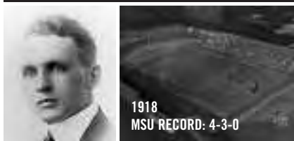
1918 MSU RECORD: 4-3-0