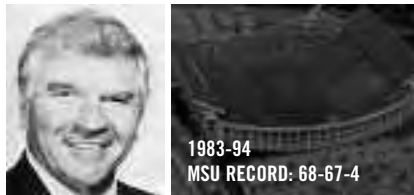
1983-94 MSU RECORD: 68-67-4

Former Spartan griddier and assistant coach George Perles saw his dream of becoming head coach of the MSU football program come true when he was named to the position on Dec. 3, 1982. After posting just 10 wins in three seasons prior to his arrival, Perles helped return MSU to national prominence with two bowl appearances in his first three seasons. In 1987, Perles and the Spartans captured the Big Ten title and made the program's first Rose Bowl appearance since 1966. The Spartans topped USC, 20-17, ending the year at 9-2-1, the most victories by an MSU squad since 1966, along with a No. 8 national ranking. His efforts that season earned him Football News ' Coach of the Year honors. The Rose Bowl began a string of four-straight bowl appearances which included triumphs in the 1989 Aloha and '90 John Hancock Bowls. The architect of the