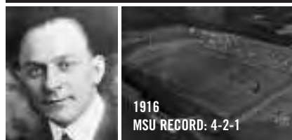
1916 MSU RECORD: 4-2-1