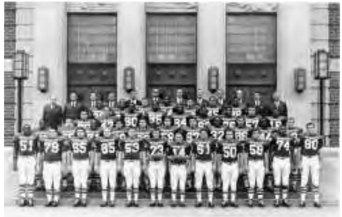
1965 National Champions (10-1-0) Selectors: Consensus – FWAA, NFF, UPI, Berryman, DeVold, Dunkel, FB News, Helms, Litkenhous, Poling, Sagarin