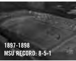
1897-1898 MSU RECORD: 8-5-1