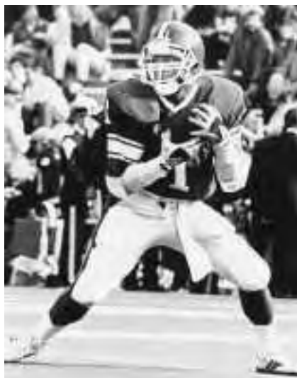
Andre Rison tops Michigan State's career charts in receptions (146) and receiving yards (2,992).