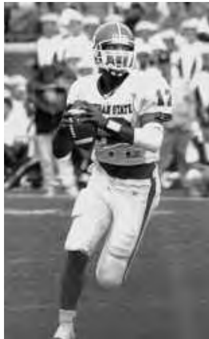
In just two seasons, Tony Banks threw for 4,129 yards and 20 touchdowns while posting 11 200-yard passing games.