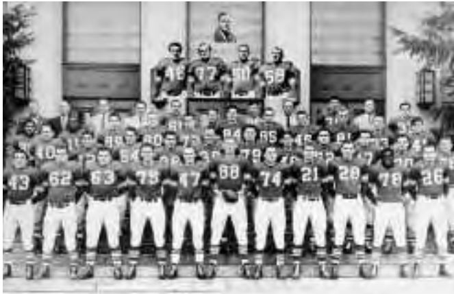
1951 National Champions (9-0-0) Selectors: Helms, Poling

In its 109-year football history, Michigan State has won six national championships according to the list of major selectors recognized by the NCAA, including three consensus titles (1952, 1965 and 1966).