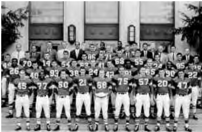
1955 National Champions (9-1-0) Selector: Board