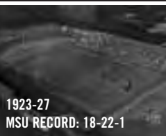
1923-27 MSU RECORD: 18-22-1