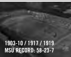
1903-10 / 1917 / 1919 MSU RECORD: 58-23-7