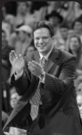
TOM CREAN MARQUETTE (1999-PRES.)