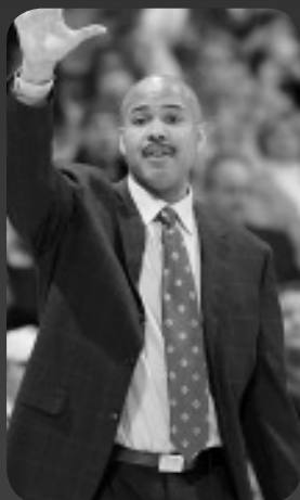
STAN HEATH KENT STATE (2001-02) ARKANSAS (2002-07) SOUTH FLORIDA (2007-PRES.)