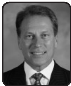
TOM IZZO Head Coach 13th Year