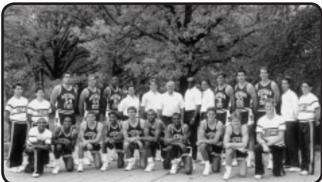
The 1989 Spartans advanced to the NIT Final Four. The core of that team returned to win the Big Ten Championship in 1990.

3/12/97 First Round (East Lansing) George Washington W, 65-50 3/19/97 Second Round (Tallahassee, Fla.) Florida State L, 68-63