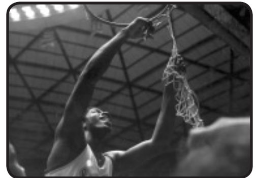
Earvin Johnson was named Most Outstanding Player of the 1979 Final Four after two great games, including a triple-double vs. Penn.