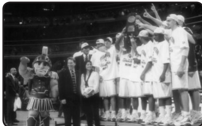
Michigan State celebrated its first Big Ten Tournament Championship in 1999.