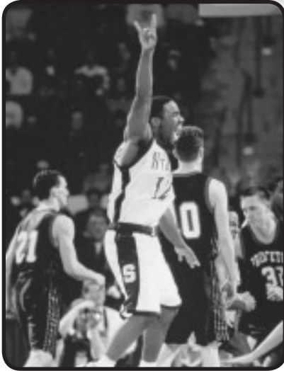
Mateen Cleaves helped MSU advance to the 1998 Sweet Sixteen for the first time since 1990.