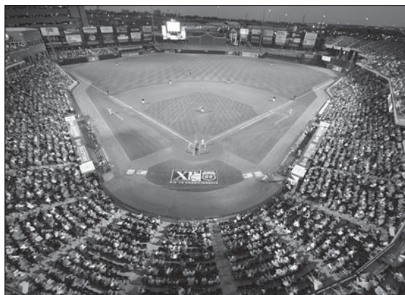
AT&T Bricktown Ballpark

For ticket information, contact the Oklahoma Redhawks at (405) 218-1000.