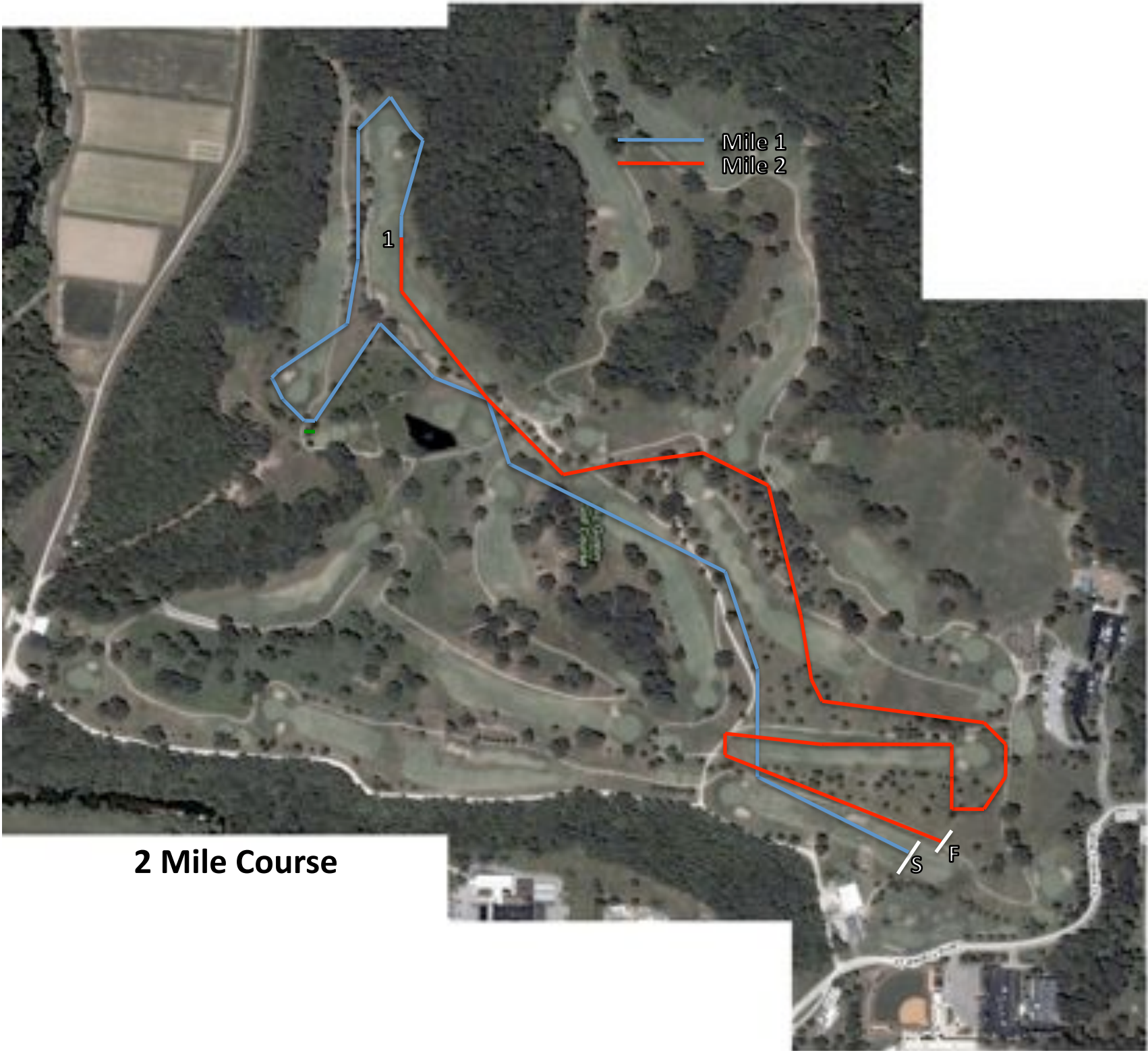
2 Mile Course