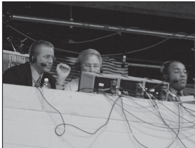
Kirk Herbstreit, Lee Corso and Mike Tirico have handled the color commentary and play-by-play call for the last five MAC Championship games, which have been televised by ESPN. Miami is slated to appear on the ESPN networks at least three times this season.