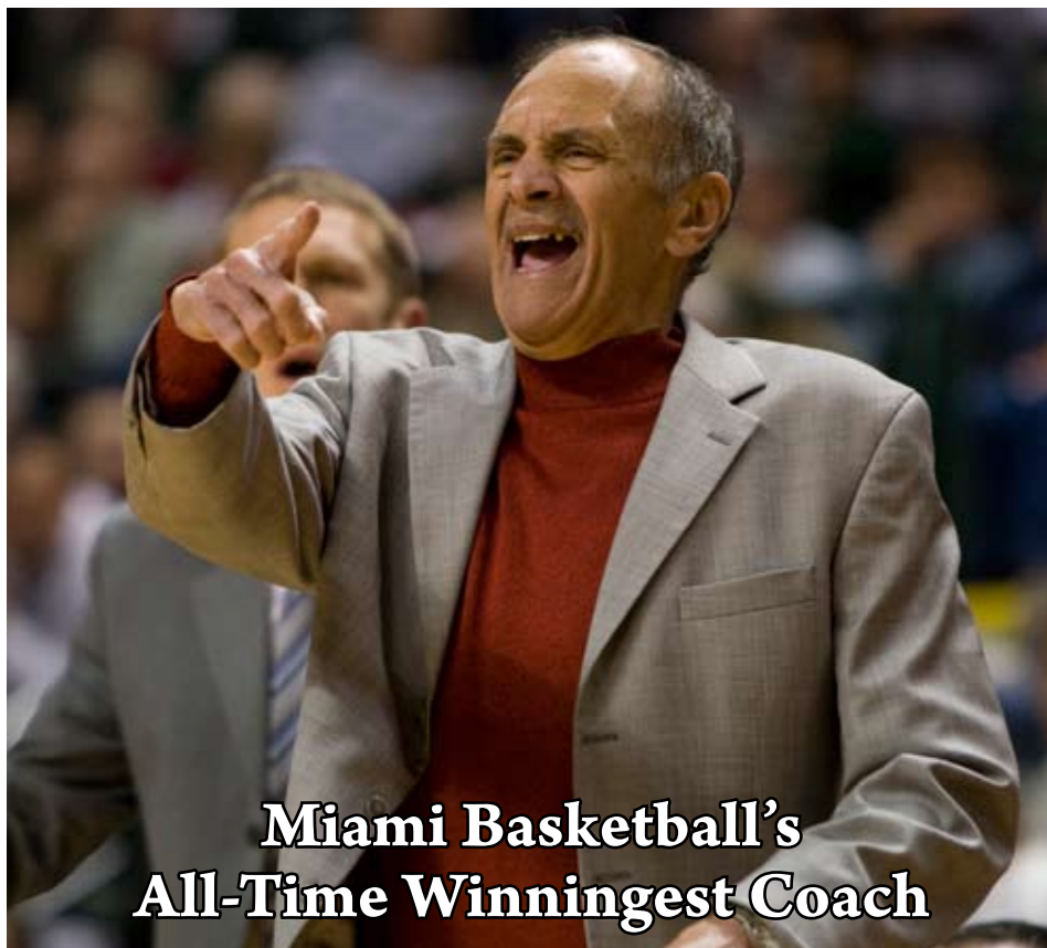
Miami Basketball's All-Time Winningest Coach