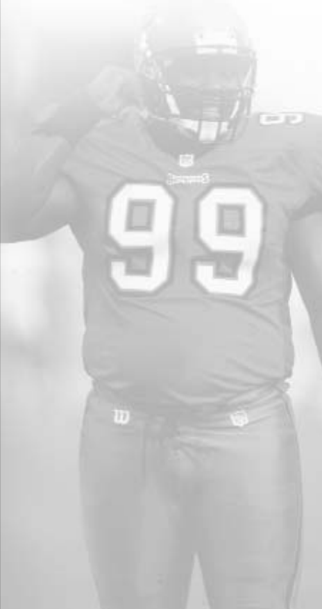
Tampa Bay's Warren Sapp