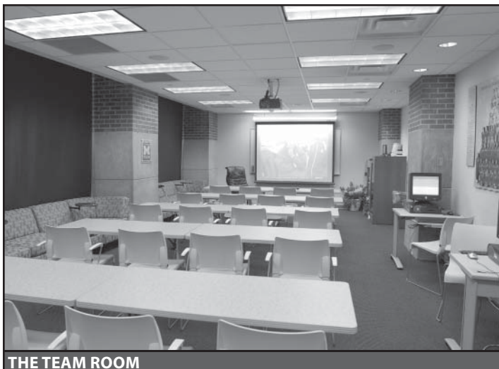
THE TEAM ROOM