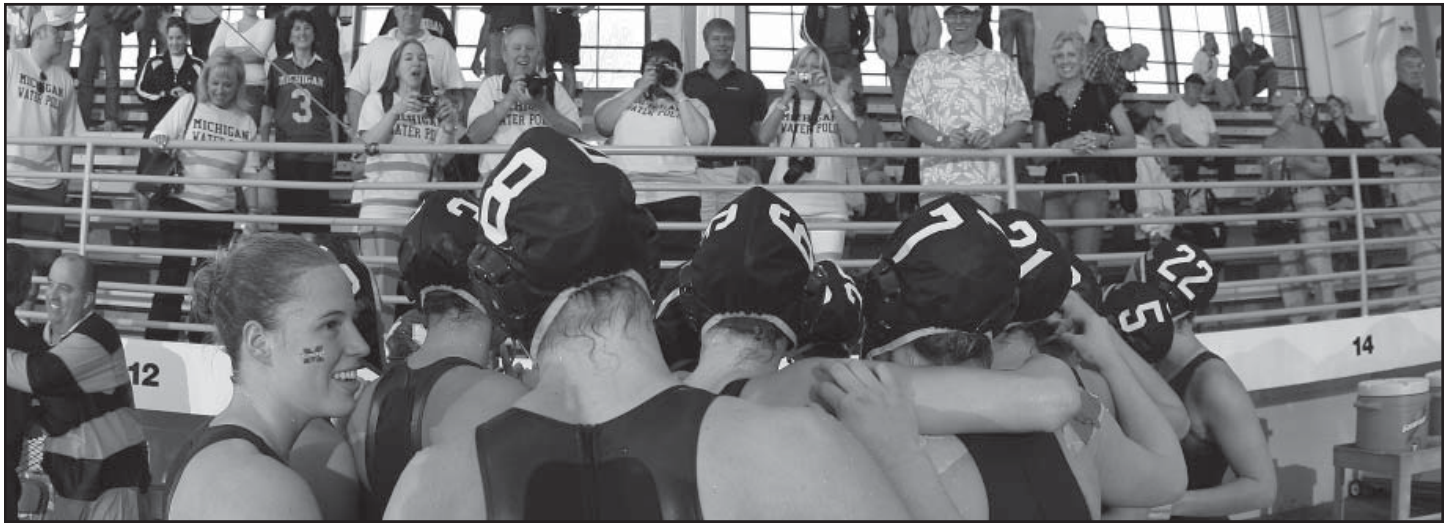
CELEBRATING WITH THE FANS

The University of Michigan continues its commitment to athletic excellence with the Donald B. Canham Natatorium, home of the Wolverine water polo and swimming and diving teams. Considered one of the finest college-owned aquatic facilities in the nation when it was constructed in 1988, a renovation in 1998 returned the facility to its original grandeur, if not surpassing it.