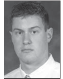
Peter Vanderkaay 2003-06 500 Free