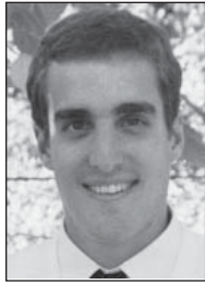
Mike Barrowman 1988-91 200 Breaststroke

In the history of the Big Ten Men's Swimming and Diving Championships, an athlete has captured four championships in a single event only 16 times. Of these 16 times, 10 belong to a Michigan Wolverine: