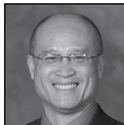
KZ Li 2010-14