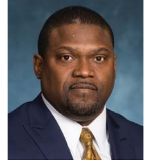
TYRONE WHEATLEY Running Backs