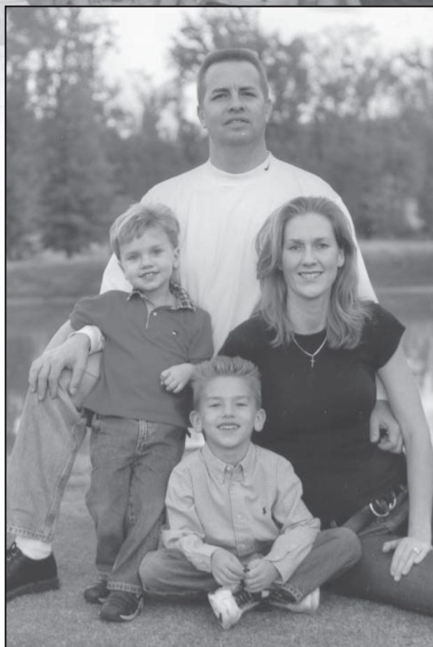
Coaches & Staff