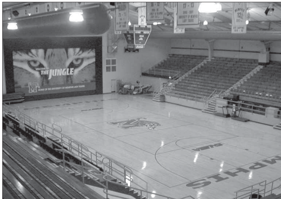
Elma Roane Fieldhouse

games. Outside of the main arena are two side gyms which are often used by the Fastbreak Club for providing food and beverages to the players and their families after each game. Located just off the main hallway is the locker room area and the athletic training facility. The locker room area