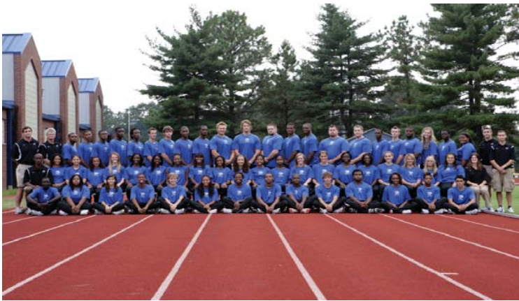
2009-2010 Memphis Track & Field Team

The University of Memphis Track and Field/Cross Country Athletic Office Building #201 570 Normal St. Memphis, TN 38152