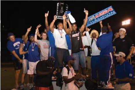
2007 Outdoor C-USA Champions