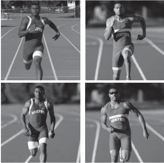
2006 Regional 4x100 Team