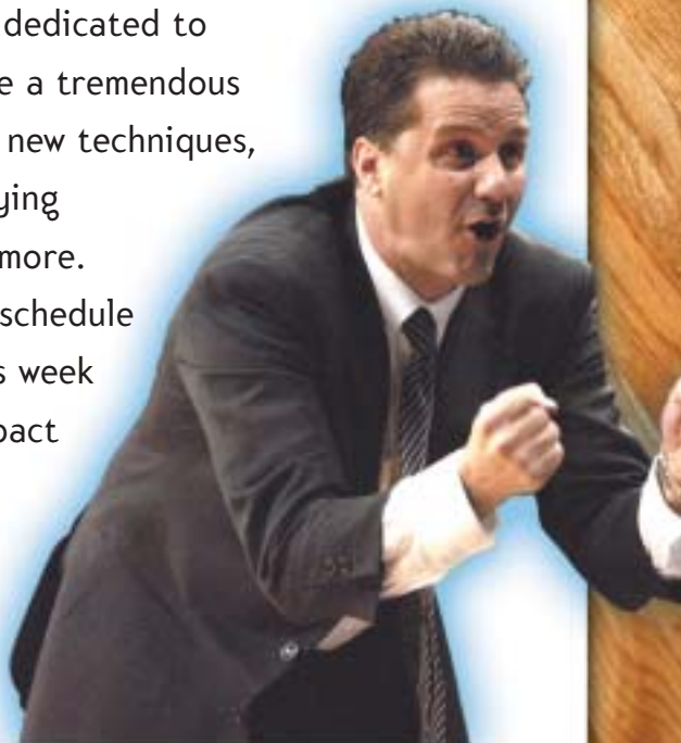
JOHN CALIPARI Head Coach

DATE: AUGUST 2-6 • MONDAY-FRIDAY • DAY CAMP