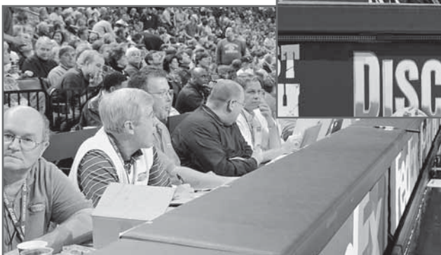
The Memphis basketball scorer's table and stats crews work all the Tiger home games and has worked the last three Conference USA Tournament held at FedExForum. The crew will also work the 2008 C-USA Tournament and 2009 NCAA Men's and 2010 Women's regionals.