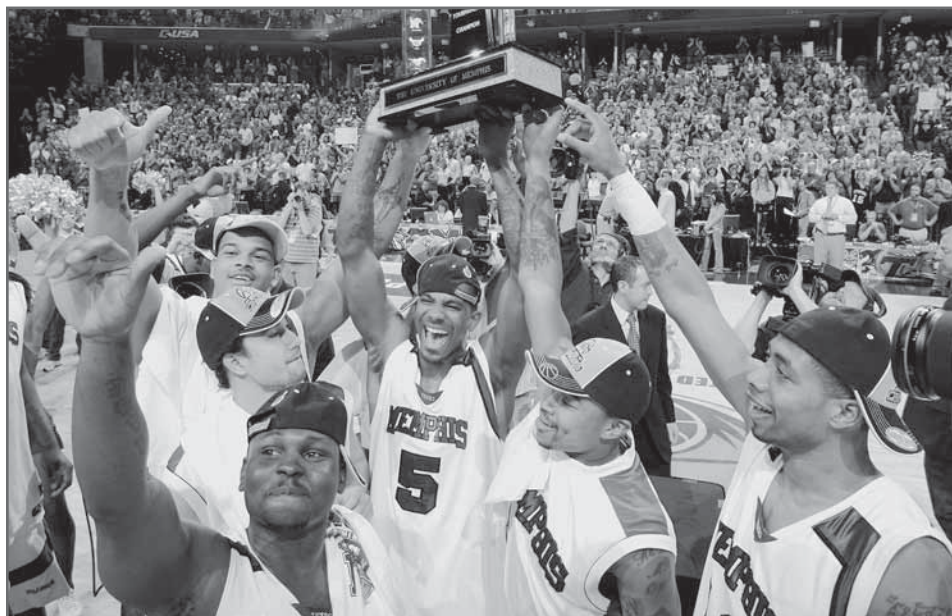
The Tigers celebrate winning the 2007 Conference USA Tournament title.