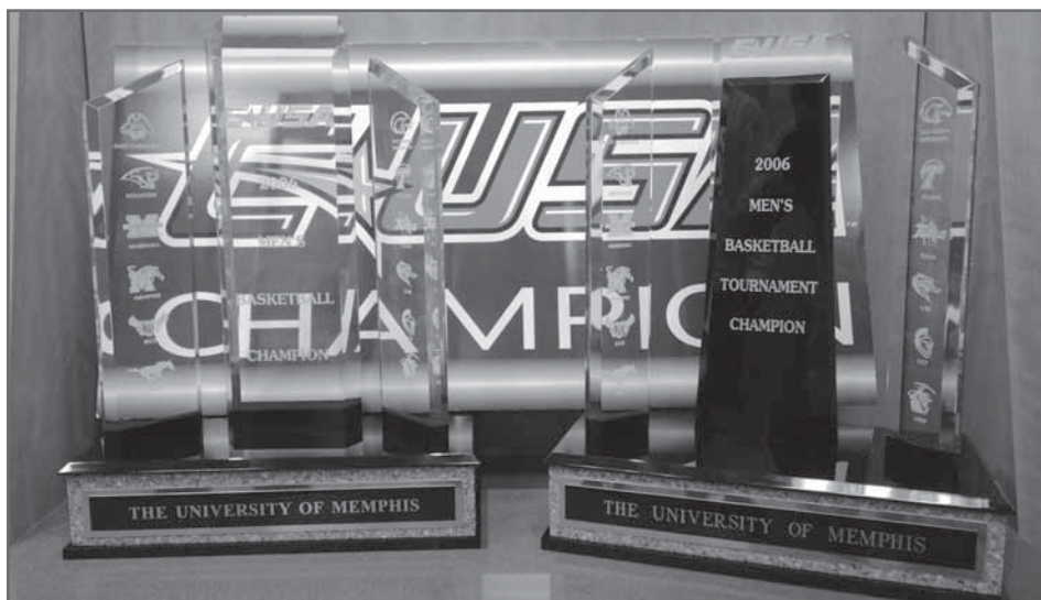
The Tigers captured both the C-USA regular season and tournament titles last year.