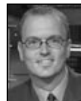
Scott Van Pelt