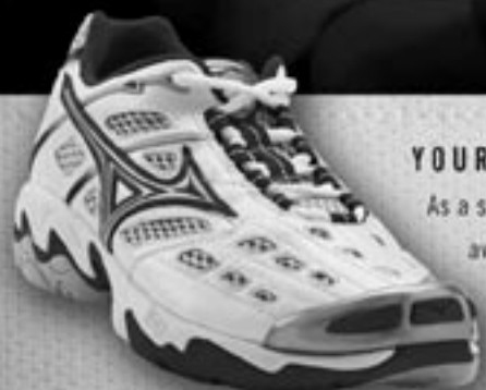
WAVE™ LIGHTNING™ 3

YOUR PASSION IS OUR OBSESSION. Do you have an uncontrollable love for the game?