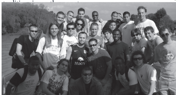
The 2008 Men's Soccer Team in Argentina

The trip was a wonderful bonding experience for the players and coaches, and it helped everyone gain a perspective of the soccer