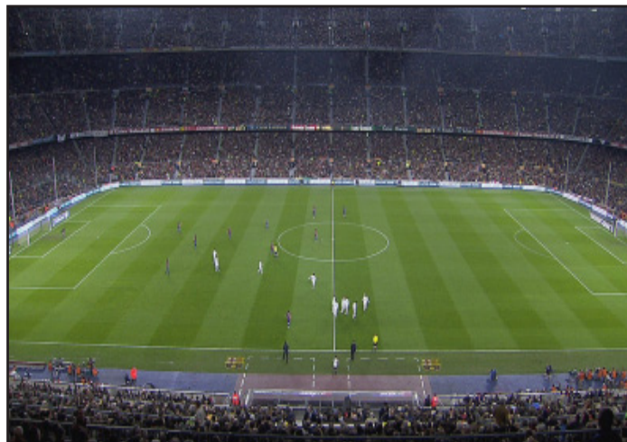
FC Barcelona vs. Real Madrid

Traveling to Spain and Portugal in 2012 will give the players and staff of the Marshall University men's soccer team a chance to play against and watch some of the best players in the world. It also allows the team to observe the values and traditions of another country.