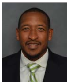
Chris Duhon Assistant Coach, third year Duke '04